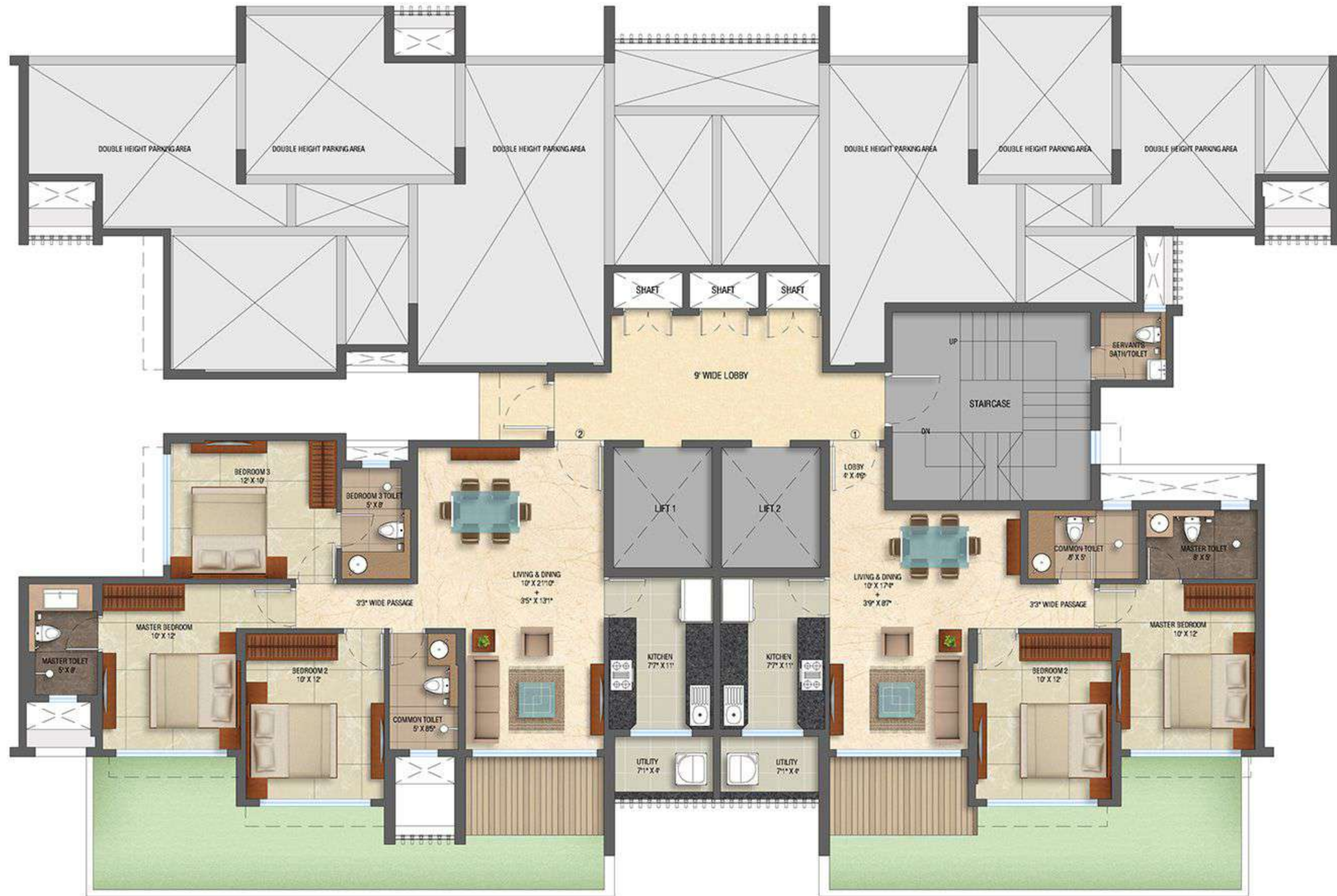
GROUND FLOOR PLAN (IDYLLIA A)