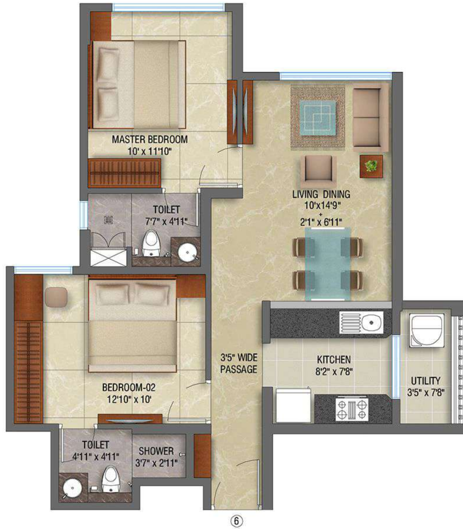
2BHK (SERENA C)