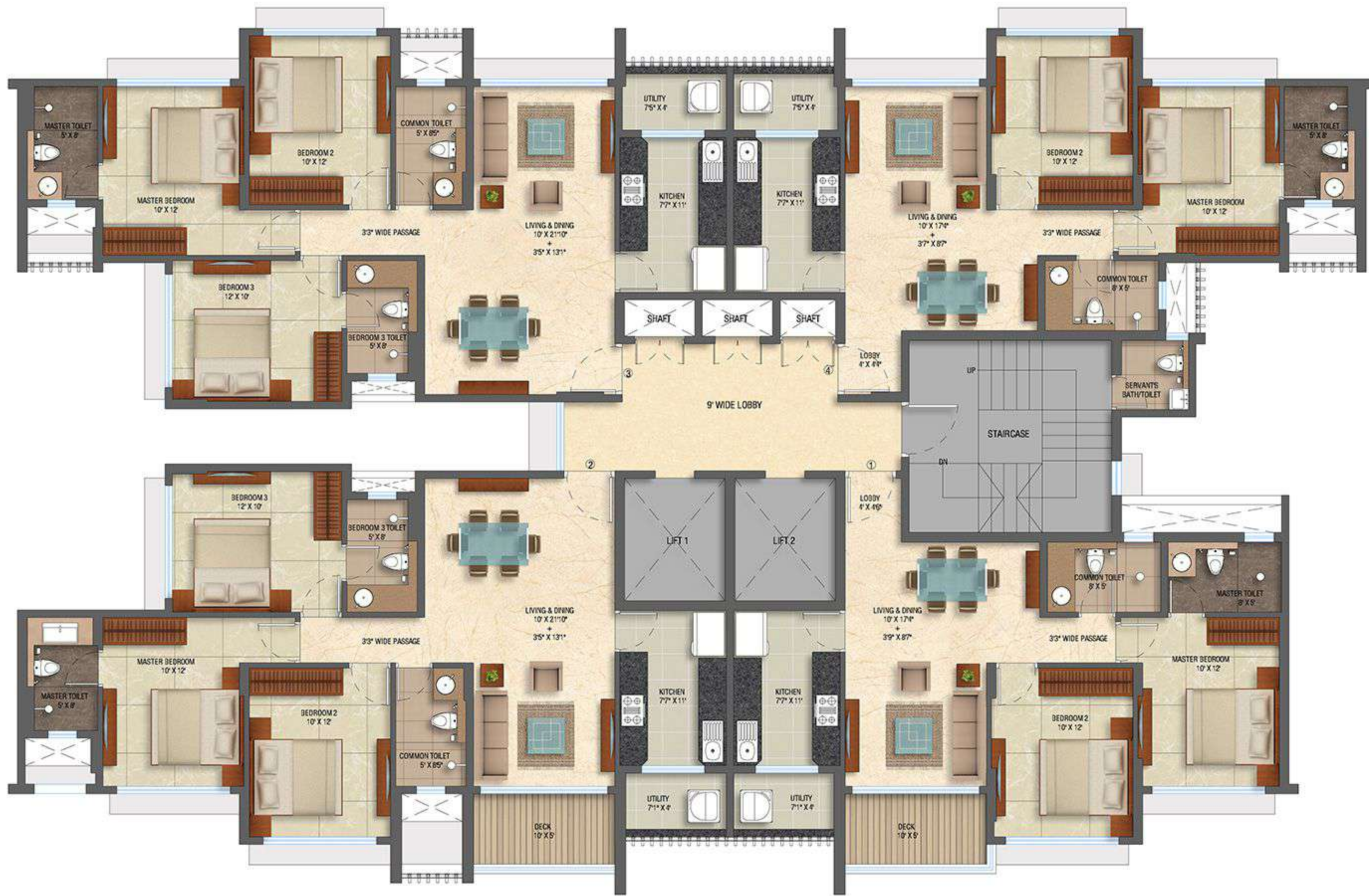
TYPICAL FLOOR PLAN (IDYLLIA A)