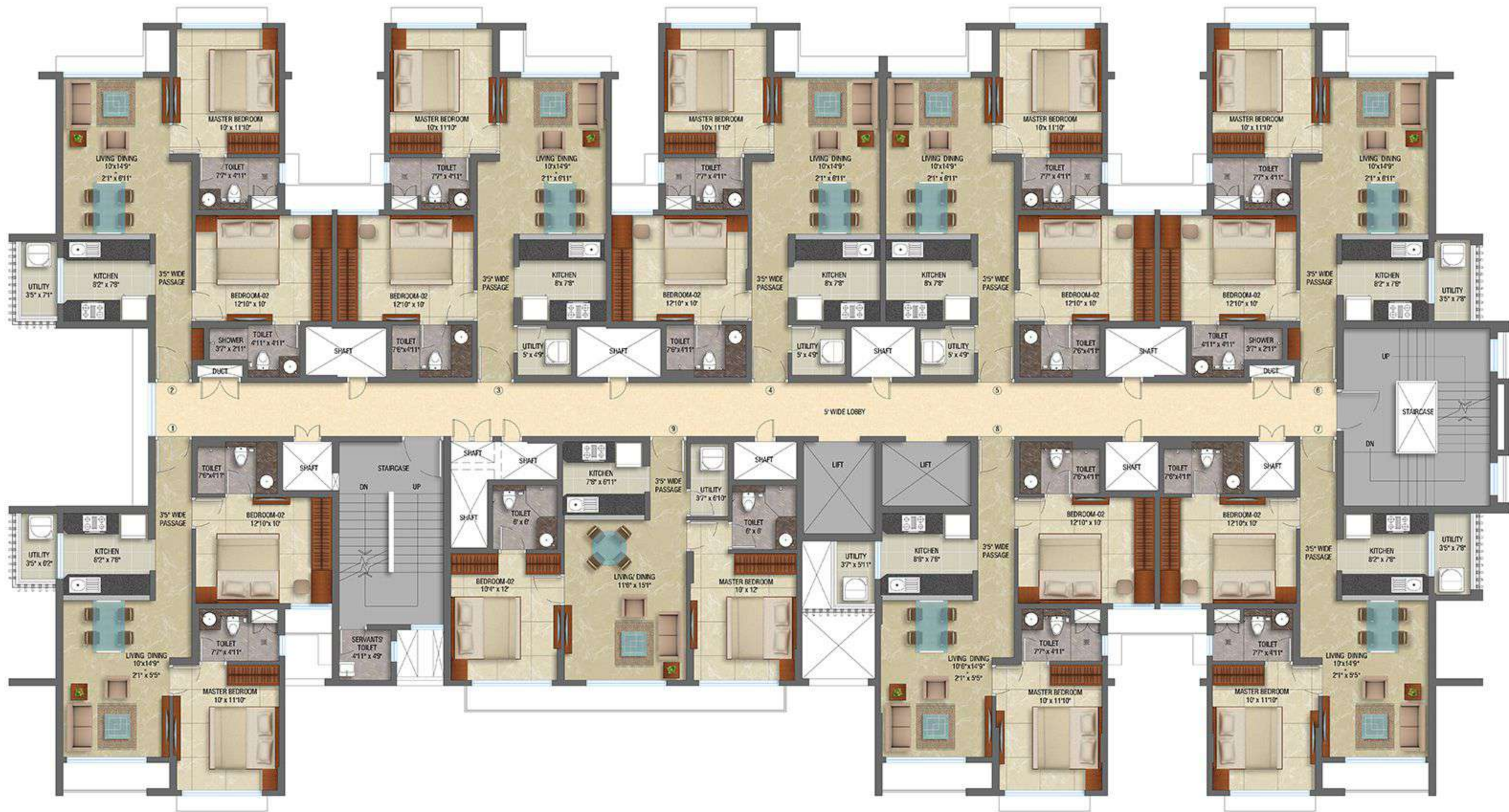
TYPICAL FLOOR PLAN (SERENA C)