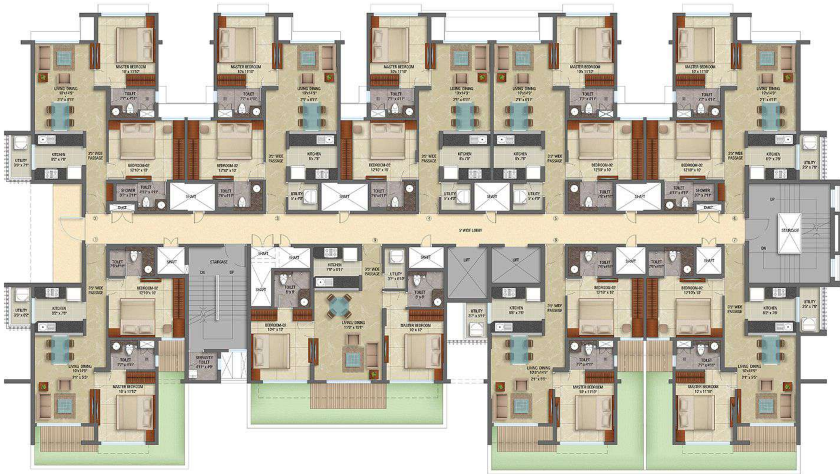
GROUND FLOOR PLAN (SERENA C)