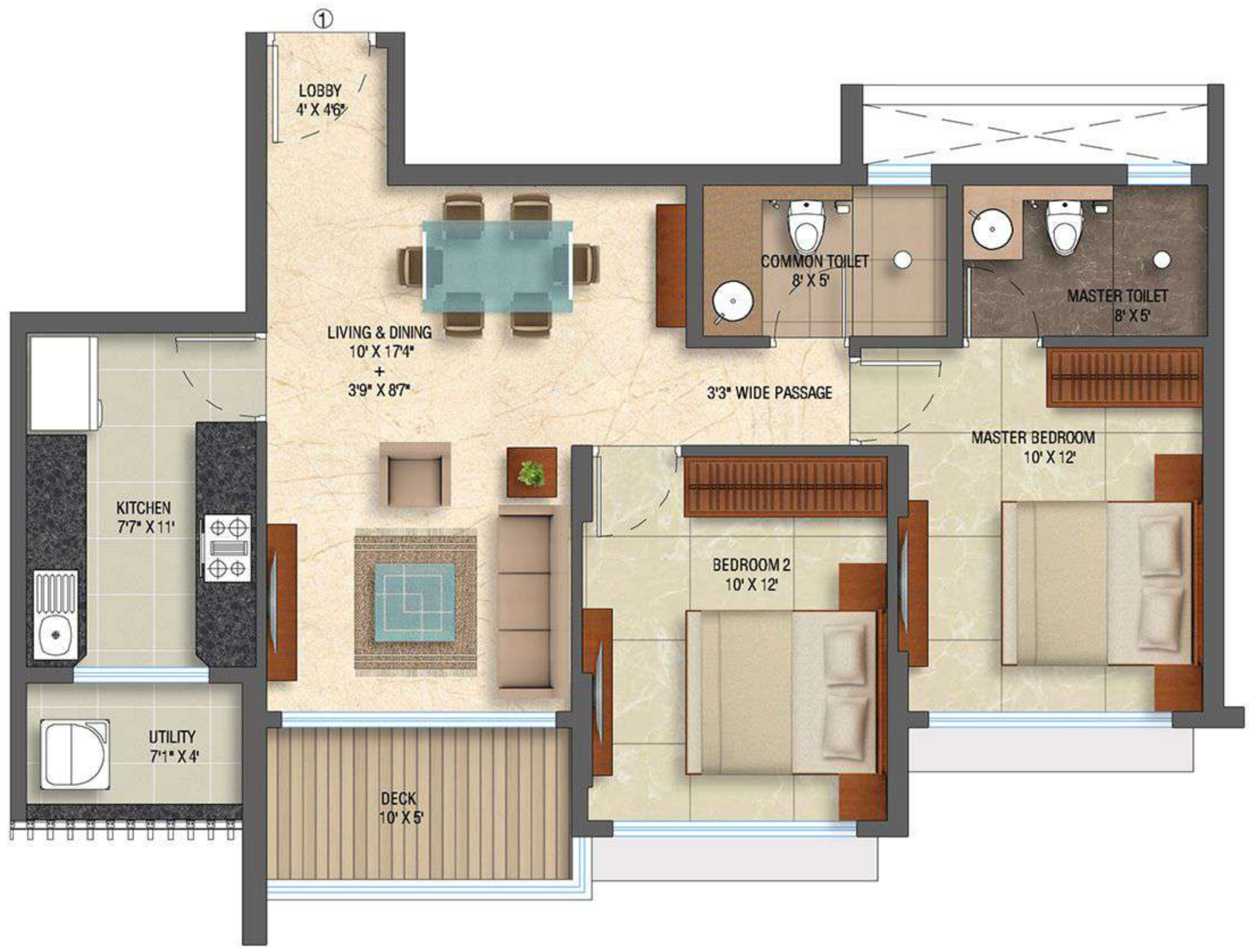
2BHK WITH DECK (IDYLLIA A)