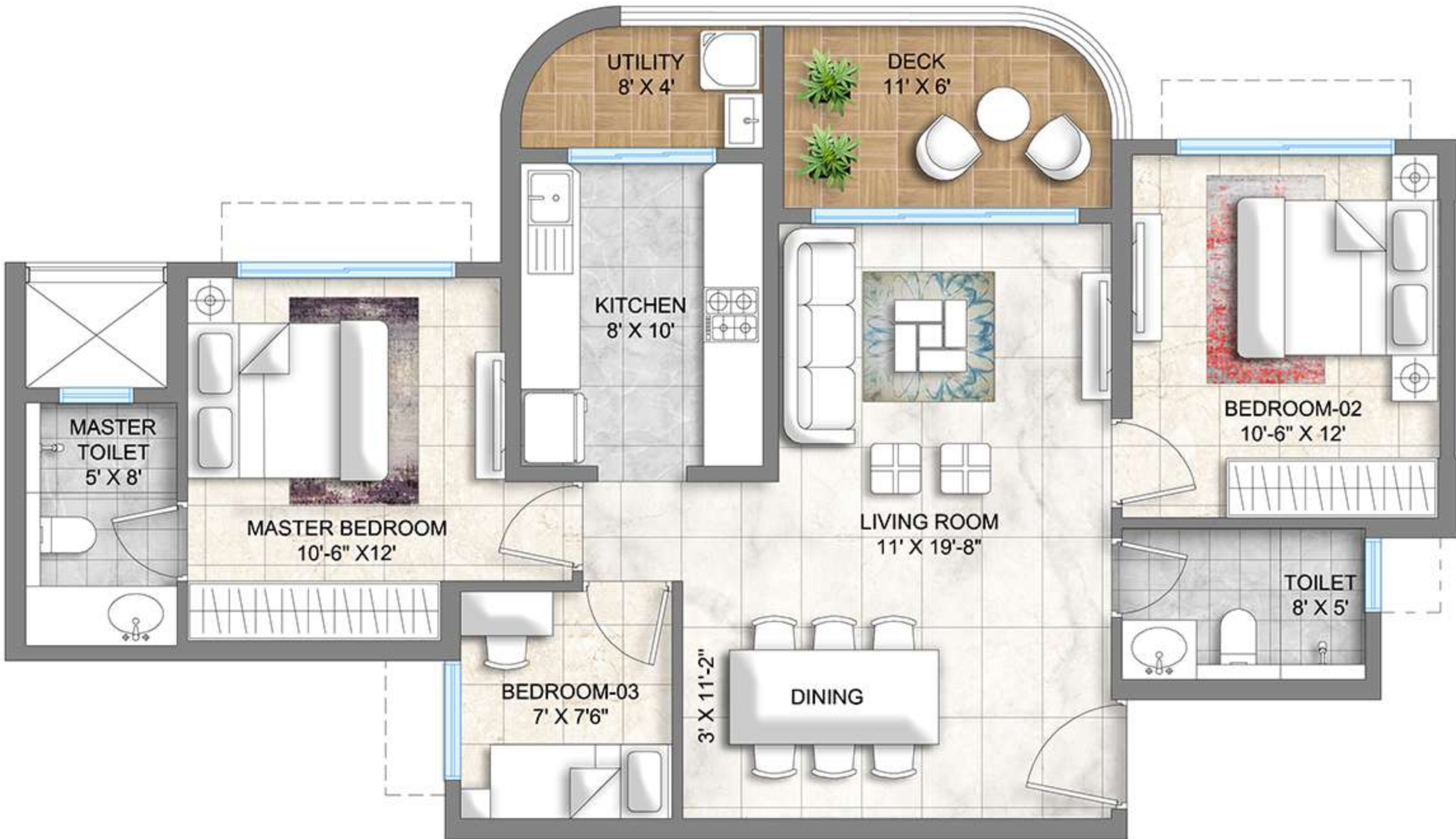
2.5 BHK UNIT PLAN