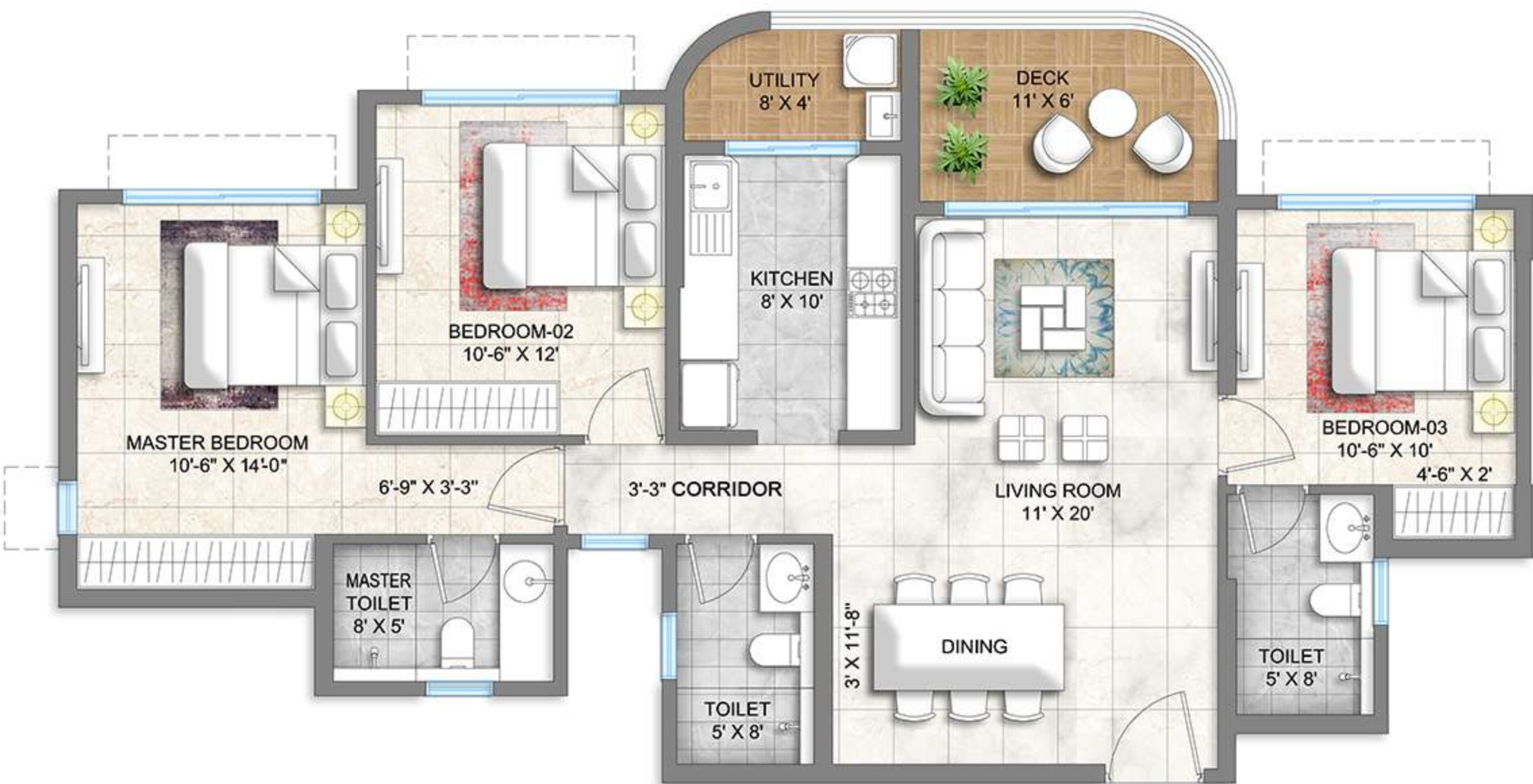
3 BHK UNIT PLAN