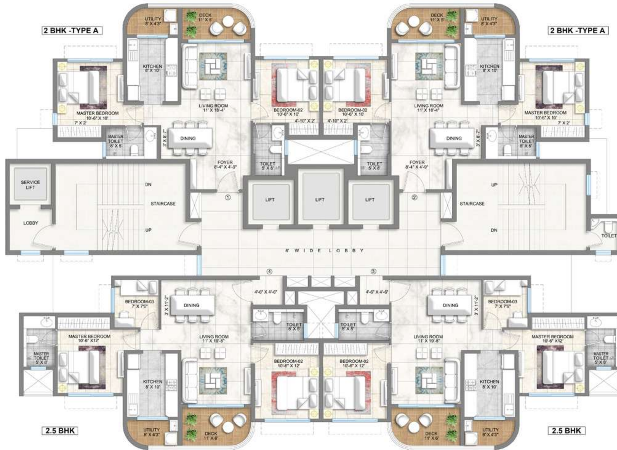
TYPICAL FLOOR PLAN TOWER 6