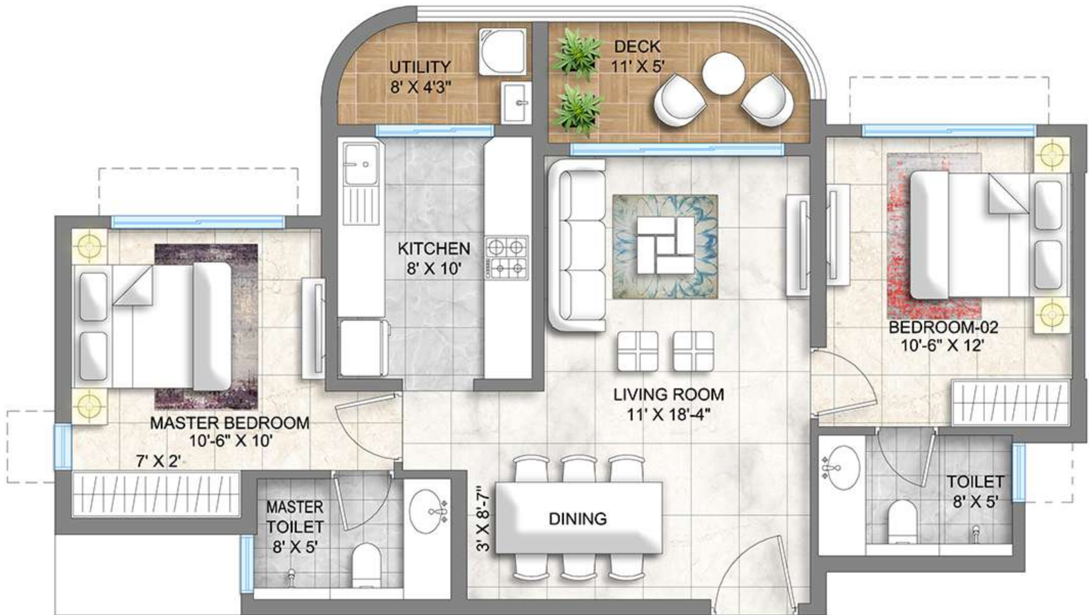
2 BHK UNIT PLAN