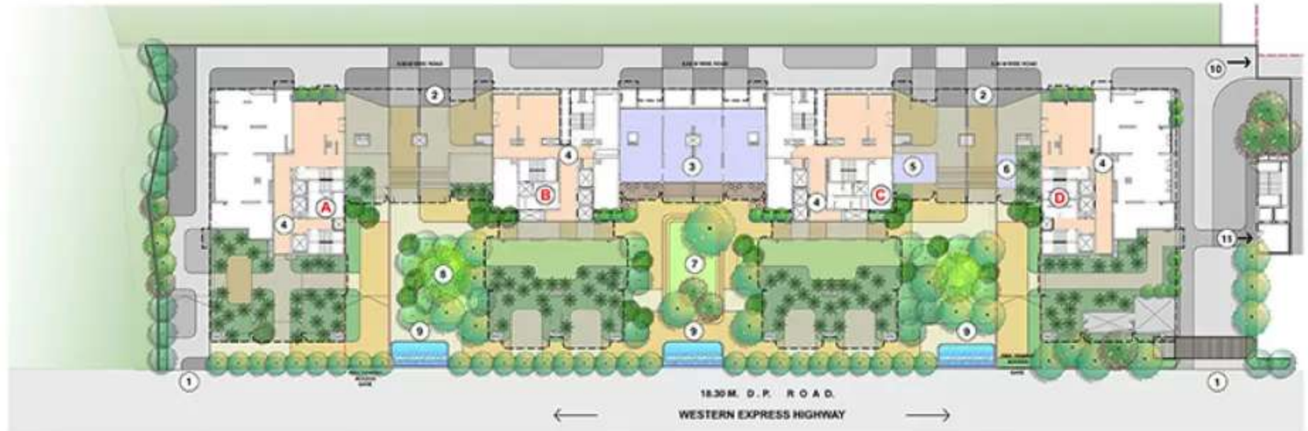
MASTER PLAN - GROUND LEVEL