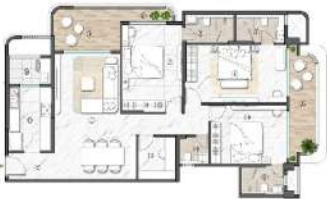
UNIT PLAN - 3 BED WITH STUDY